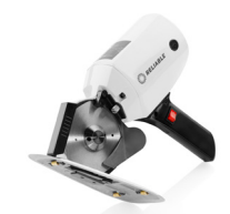
EXTRA THIN BASE PLATE