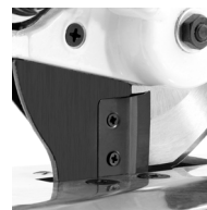
FRONT AND SIDE SAFETY KNIFE GUARDS