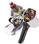
POWERFUL AC MOTOR